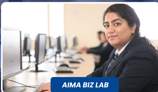
AIMA BIZ LAB