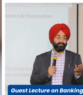
Guest Lecture on Banking