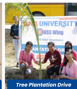
Tree Plantation Drive