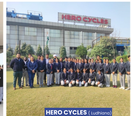
HERO CYCLES (Ludhiana)