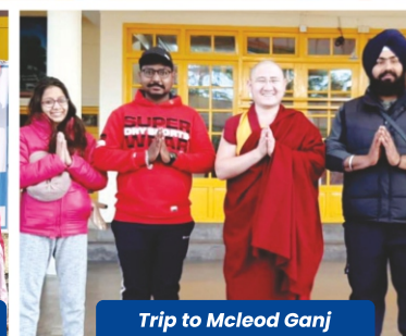
Trip to McLeod Ganj