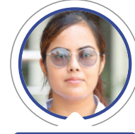
Aarti Educational Counsellor Testbook