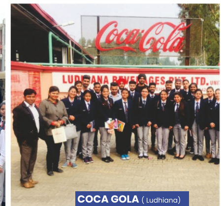
COCA COLA (Ludhiana)