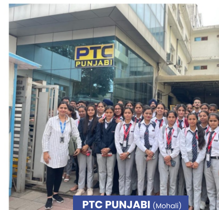
PTC PUNJABI (Mohali)