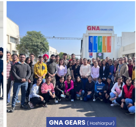
GNA GEARS (Hoshiarpur)