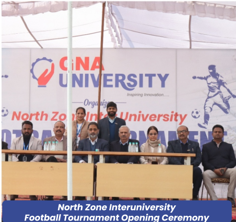
North Zone Interuniversity Football Tournament Opening Ceremony