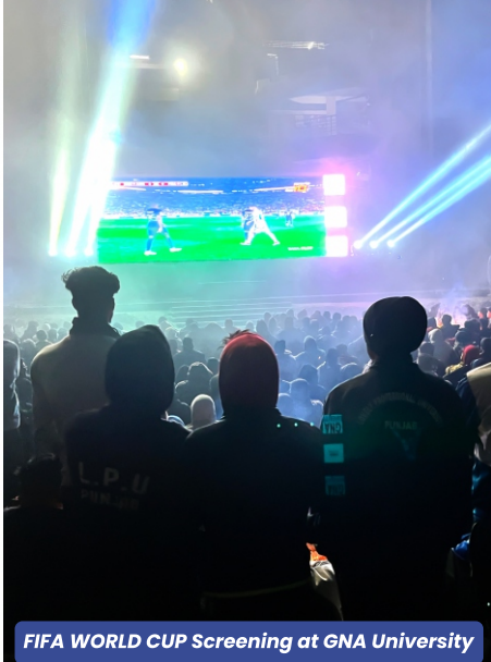
FIFA WORLD CUP Screening at GNA University