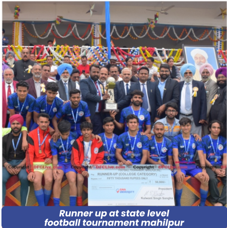
Runner up at state level football tournament mahilpur