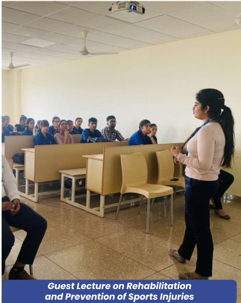
Guest Lecture on Rehabilitation and Prevention of Sports Injuries