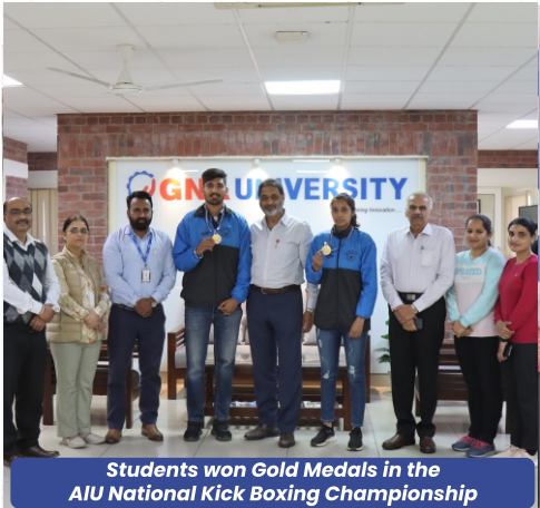
Students won Gold Medals in the AIU National Kick Boxing Championship