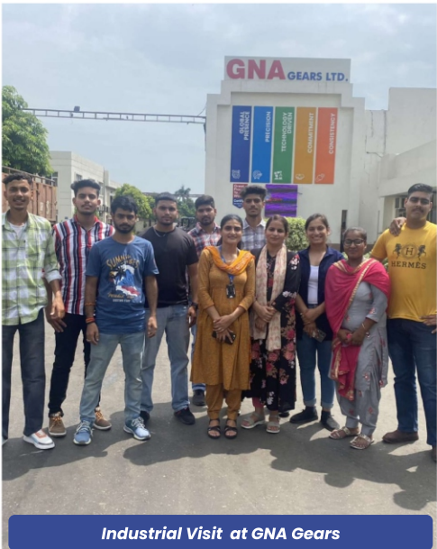
Industrial Visit at GNA Gears