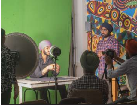
STUDIO ROOM LAB