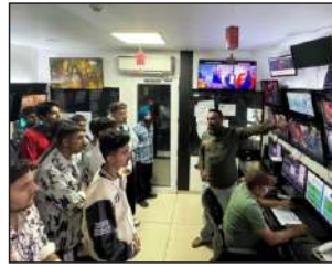
VISIT TO DIVYA TV