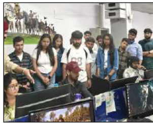
VR EXPERT VISIT