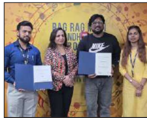
RADIO CITY - MOU