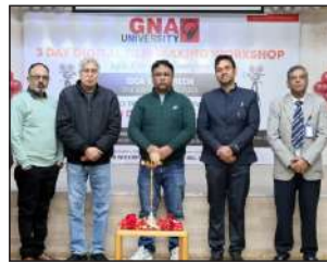
3 DAY DIGITAL FILM MAKING WORKSHOP