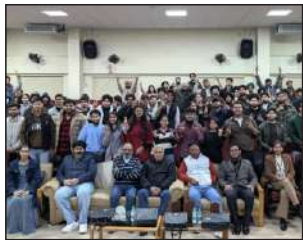
3 DAY FILM MAKING WORKSHOP