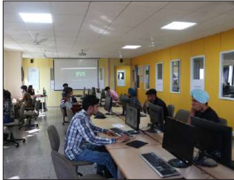
VISUAL EFFECT LAB