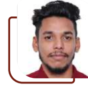
NITIN LOVELY GREEN ADS 360