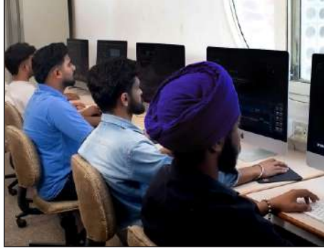
EDITING STUDIO LAB