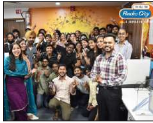
VISIT AT RADIO CITY, JALANDHAR