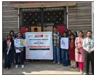
AWARENESS CAMPAIGN ON WOMEN'S DAY