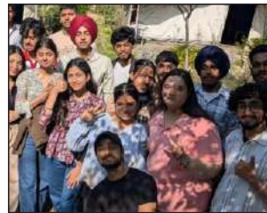
TRIP TO HIMALAYAS