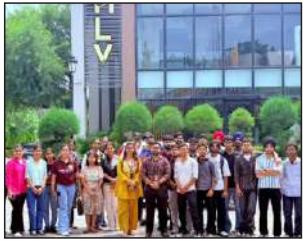
VISIT AT HLV FILM CITY