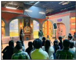
VISIT TO PITAARA TV