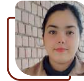
AMARPREET KAUR BRILLIANT INSTITUTES