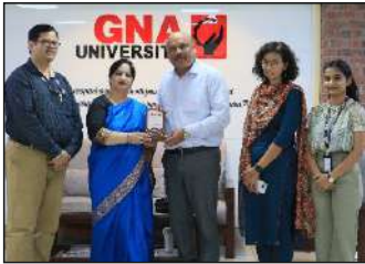
WORKSHOP ON CREATIVE WRITING