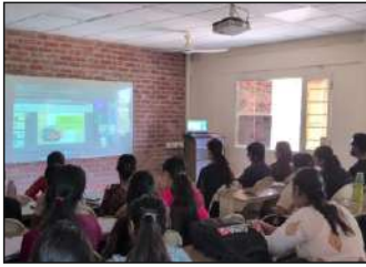
GUEST LECTURE ON RELEVANCE OF LITERATURE STUDIES