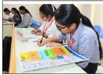
COMPETITION ON WORLD DICTIONARY DAY