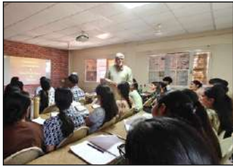
WORKSHOP ON CRAFT OF TRANSLATION