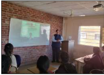
WORKSHOP ON LITERATURE, INNOVATION AND CREATIVE THINKING