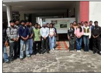
WORLD THEATRE DAY