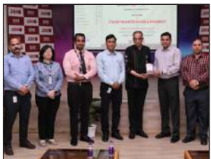
GUEST LECTURE ON FOOD WASTE MANAGEMEN