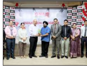
GUEST LECTURE ON INDUCTION PROGRAM