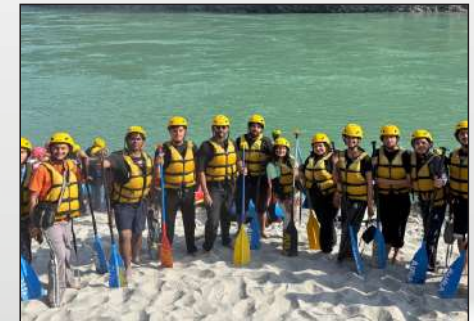
EDUCATIONAL TOUR TO RISHIKESH, HARIDWAR, MUSSOORIE, AND DEHRADUN