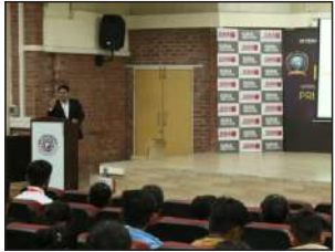
GUEST LECTURE ON THE TOPIC, "LICENCES REQUIRED TO OPERATE A BAR IN A 5 STAR HOTEL"