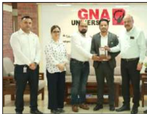
WORKSHOP ON "MOCKTAIL MAGIC"