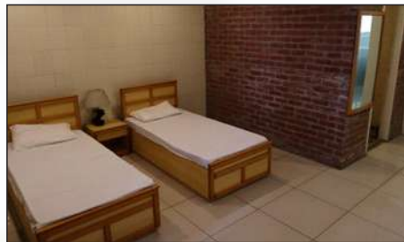
MODEL GUEST ROOM