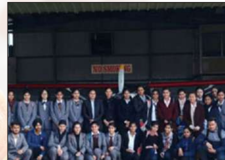
GNA AVIATION ACADEMY