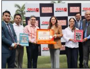
CELEBRATED NATIONAL NUTRITION WEEK 2024