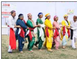
HIMACHALI DHAM CELEBRATION