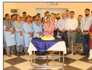
INTERNATIONAL HOUSEKEEPING WEEK 2025