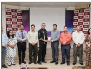
WORKSHOP ON DESIGNED FOR ASPIRING ENTREPRENEURS AND STARTUP ENTHUSIASTS