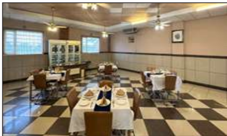
BASIC TRAINING RESTAURANT