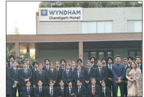
INDUSTRIAL VISIT TO THE WYNDHAM, CHANDIGARH (MOHALI)