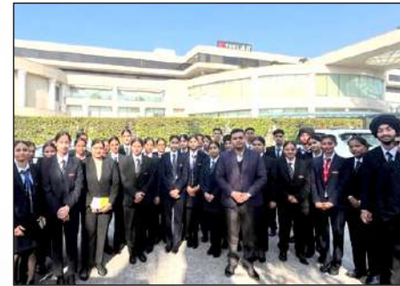
INDUSTRIAL VISIT TO THE LALIT CHANDIGARH