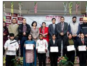
CELEBRATED NATIONAL TOURISM DAY