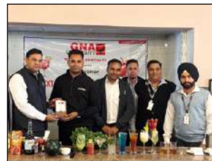
WORKSHOP ON MOCKTAIL PREPARATION