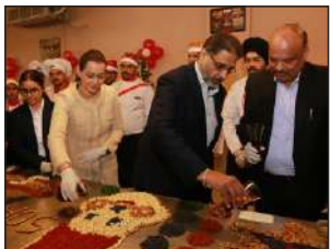
CAKE MIXING CEREMONY