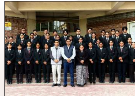
COURTYARD BY MARRIOTT, AMRITSAR