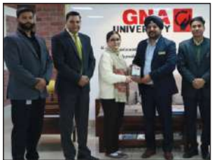
JOB PLACEMENT DRIVE WITH "SEVEN SEAS"