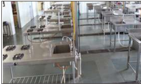
BASIC TRAINING KITCHEN