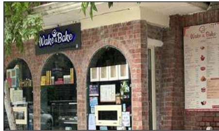
WAKE & BAKE BAKERY SHOP